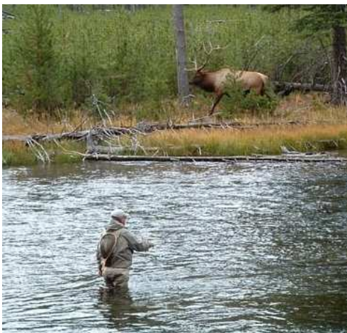
"Nymphing for Elk"

Join us for WCFE week-long fishing trip October 2-7, 2006. Now is your chance to become a "trout bum" on some of Oregon's best fly water. Those attending will travel together, camp (or stay in a nearby motel) at two or three locations and fish. Each location may include river and lake fishing. We'll meet for pot-luck meals and swap stories (and flies) each evening. A grocery store and hot shower will be available between fishing locations. These informal, affordable, "no host" trips are a great way to learn new water. Last year we fished two days on the Owyhee River and one day each on the Donner and Blitzen and Crooked Rivers. Two years ago we fished Hosmer Lake for two days and spent one day each on the Fall, Crooked, and Deschutes Rivers. Please contact Hal Gordon ( gordonhw@yahoo.com ) to get your name on the list so we can begin planning our next adventure.