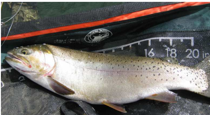
Ralph also caught a nice rainbow at Henry's Lake